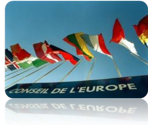
Council of Europe